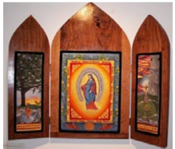
Lady of Faith Lady of Infamy