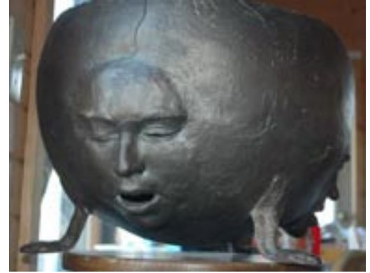
Age of Fire: Transformation